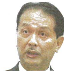
Dr Noor Hisham Abdullah

"Bagi penularan dalam negara membabitkan rakyat Malaysia, 10 kes adalah daripada Kluster PUI Sivagangga di Perlis dan masing-masing satu kes daripada kluster sama di Kedah ser-