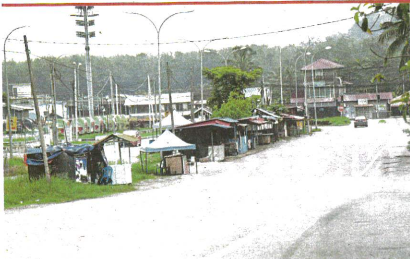
It is all quiet in Pekan Napoh, Jitra, following the implementation of the Targeted Enhancement Movement Control Order due to rise in cases from the Sivagangga Persons Under Investigation cluster.